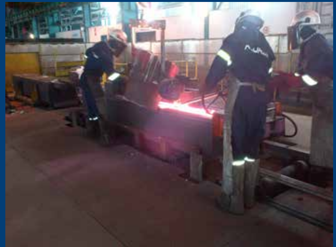
Cathode Sealing Block Sealing