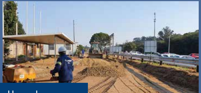
Parking Area Upgrade