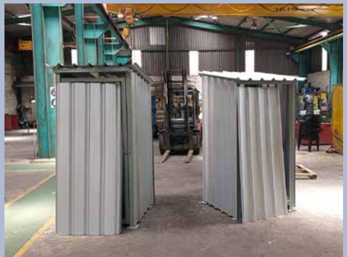
Water Tank Shelters - Sheetting