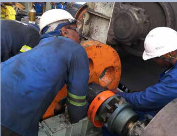
Fly Wheel Upgrade