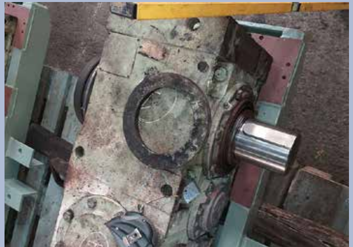
ST10 Long Travel Drive Upgrade