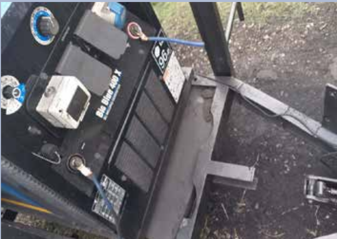
Boiler Shop Welding Machine Mods