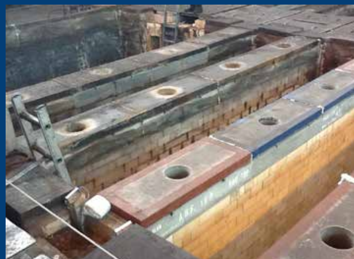
Bake Furnace Installed Wall