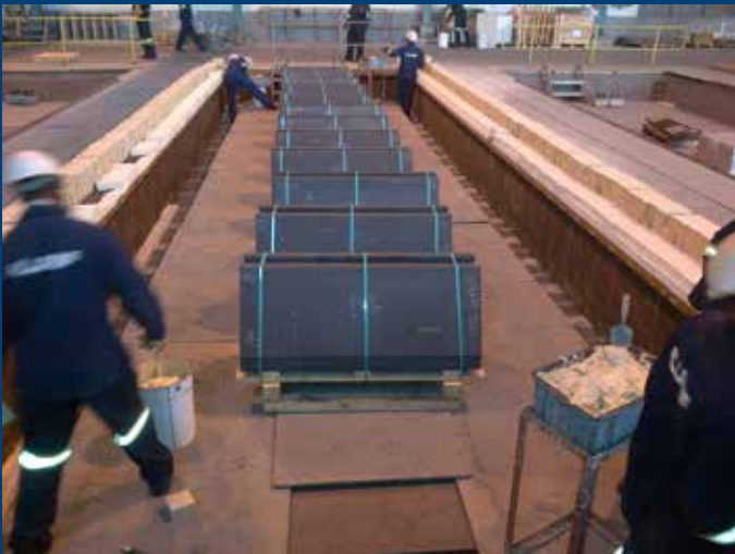
Pot Relining Brickwork