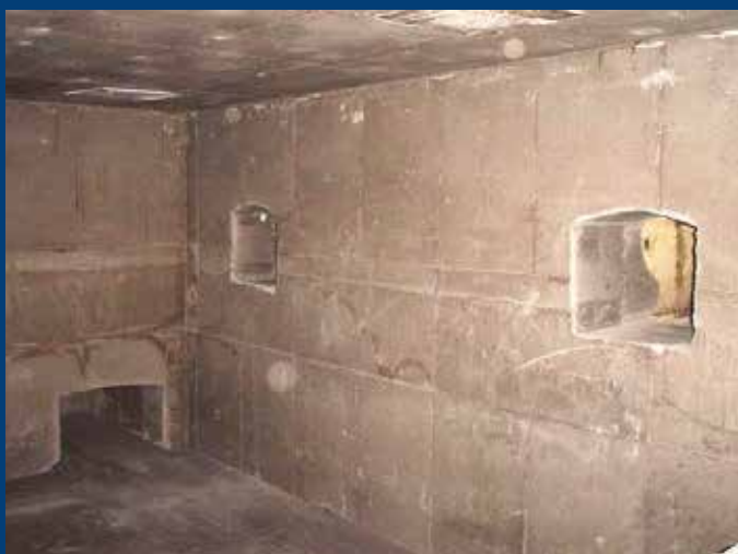
Casthouse melting furnace completed